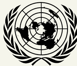
Emblem of the United Nations

In South Africa, indabas (gatherings of community representatives with expertise in a particular area) are often held. Representatives of local, national and international bodies are invited to share, discuss and consolidate their ideas around a particular development issue of local or national importance.